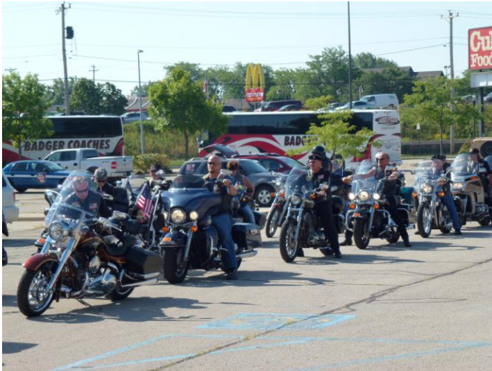
Pictured are District 3 and Post 59 Legion Riders escorting an Army Reserve Unit home to Dodgeville after 13 months in Iraq.