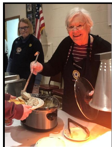
January Breakfast Volunteers - Second Shift