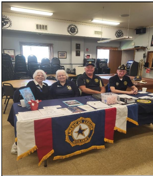
Membership table @ Veterans Resource Event at VFW