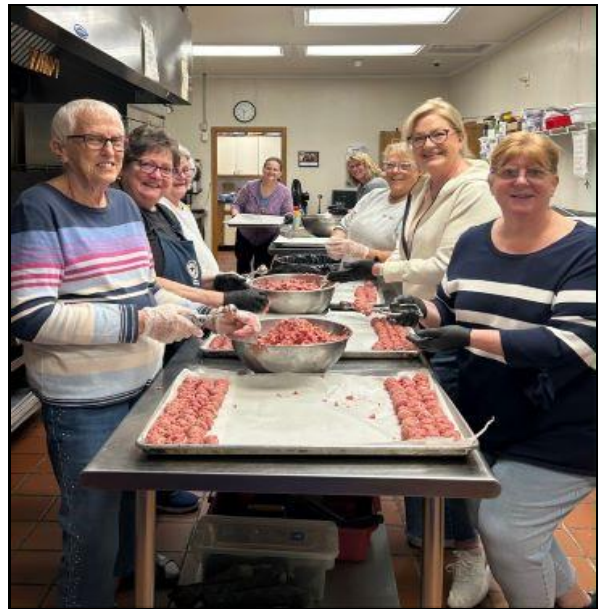
Patriotic Stitchers preparing food for April Monthly Members Dinner