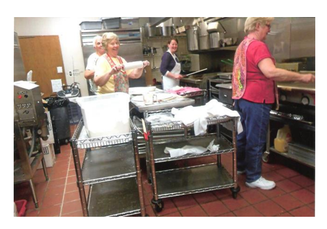
Lefsa makers in the Post galley